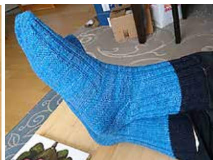
(a few of the many pair she knit for him)