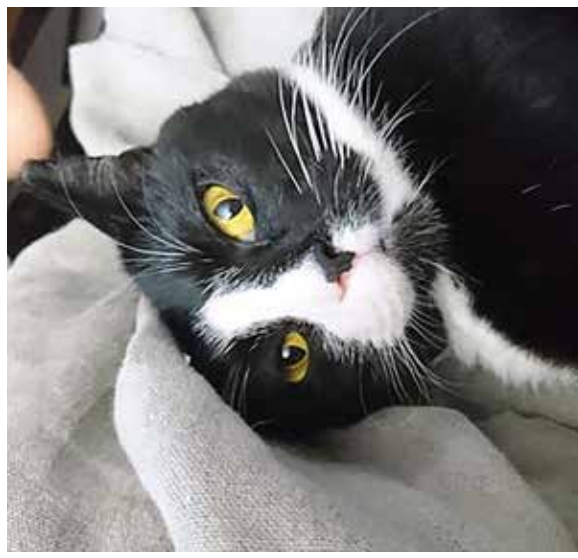
The Tuxedo Twins' Kittenball Run (and other cat stuff) Page 5