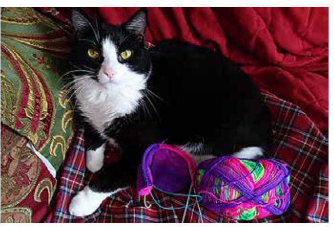
The Tuxedo Twins' Kittenball Run (and other cat stuff) Page 4