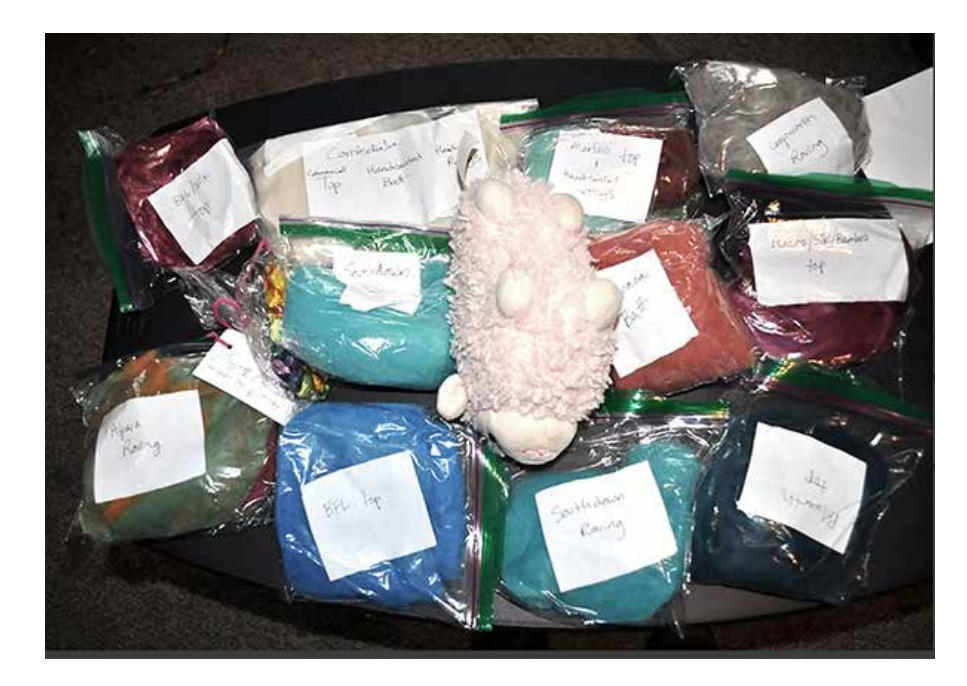
Fiber arayti sent to Swadlow