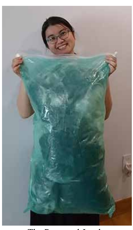
The Perpetual Jacob, from Amara